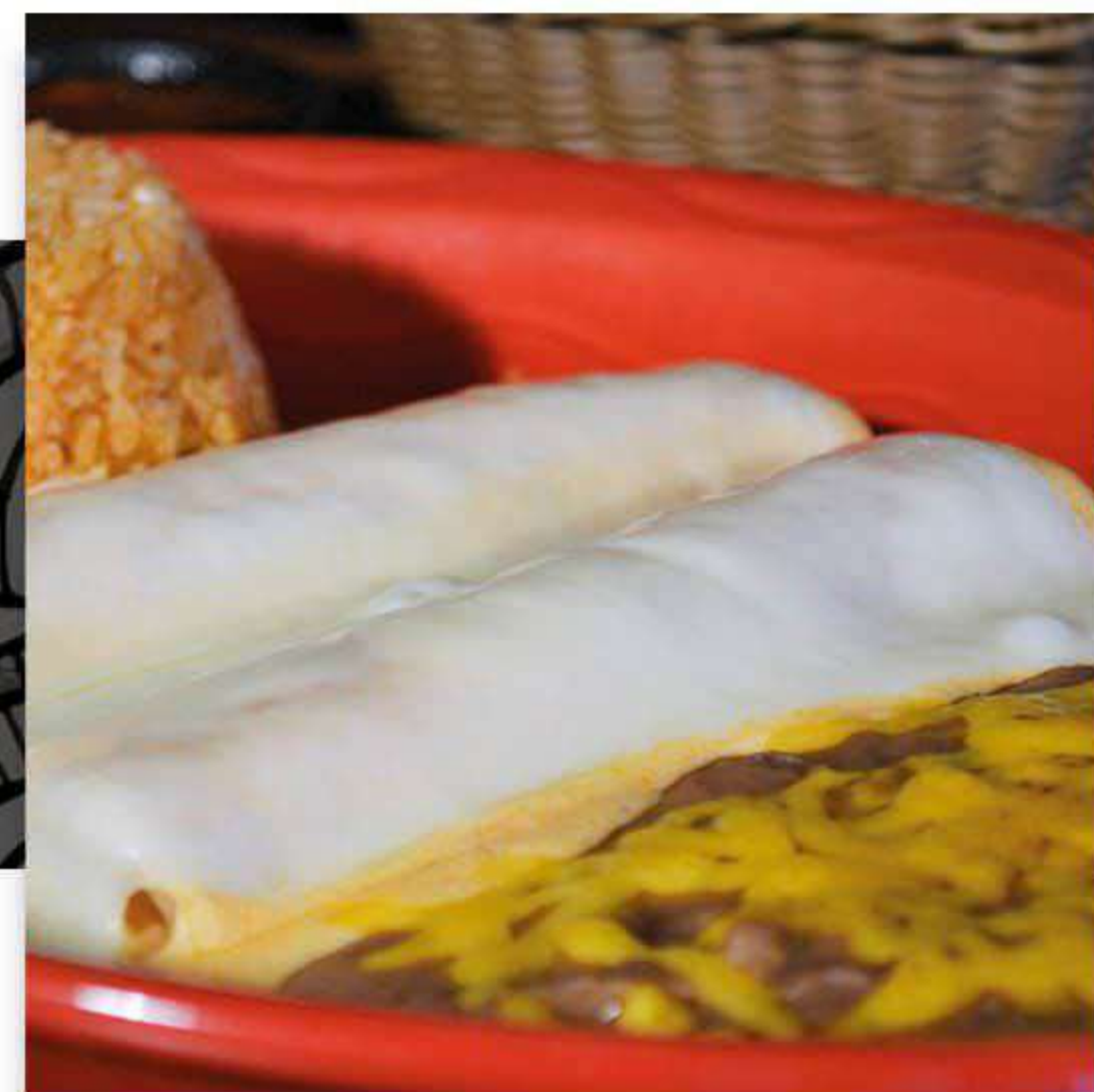
Two Enchiladas a la Crema

First basket of Chips is complimentary $1 Extra Chips