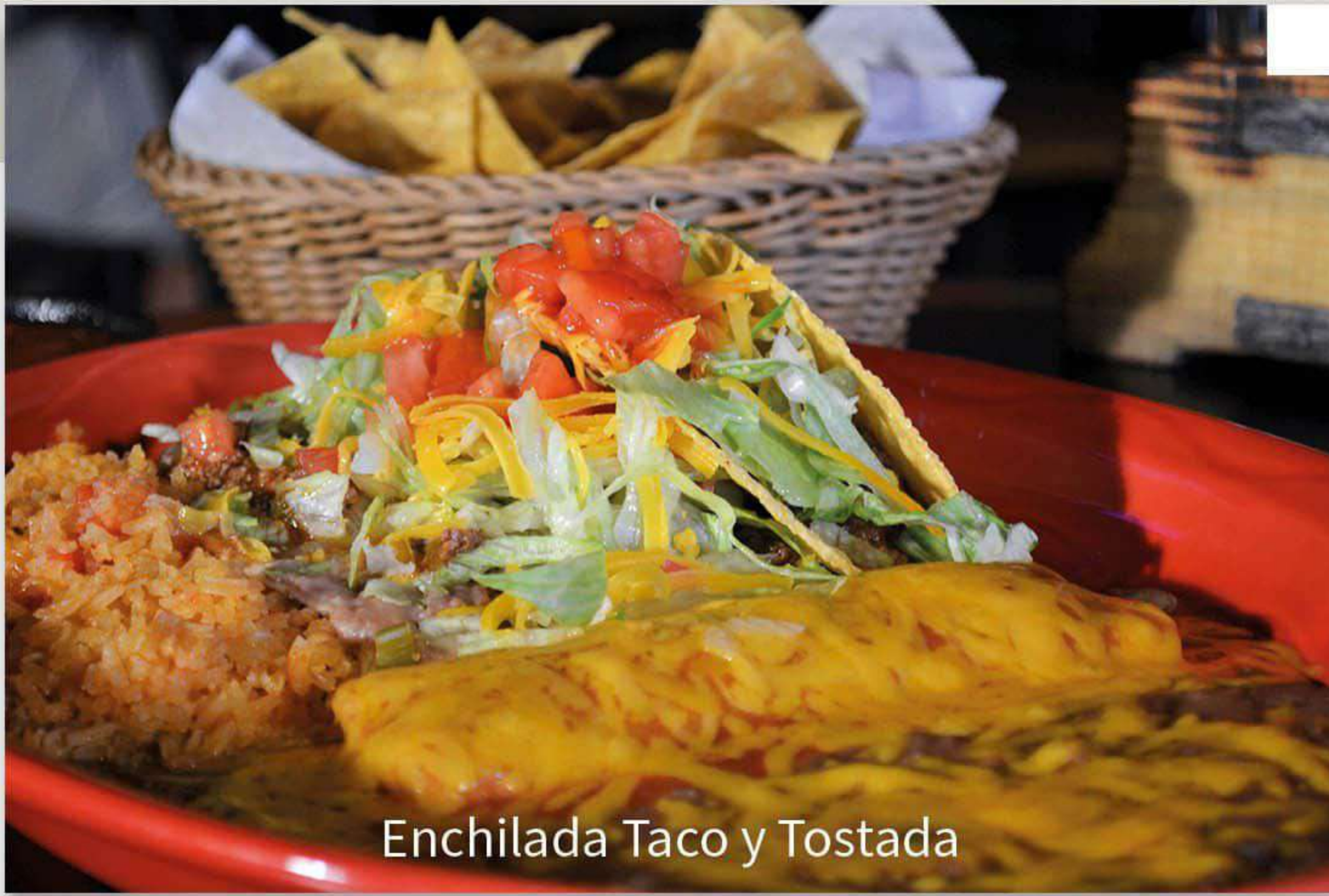
Enchilada Taco y Tostada