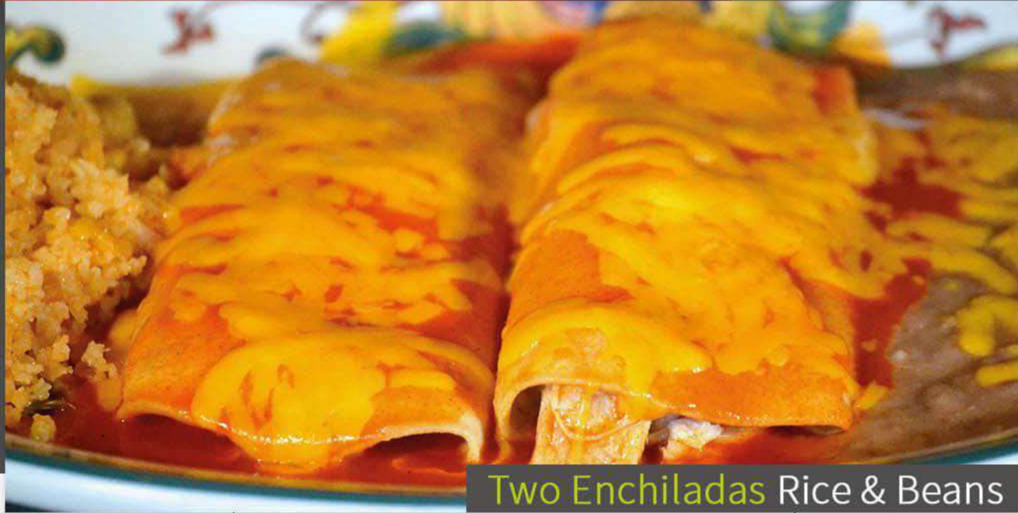
Two Enchiladas Rice & Beans