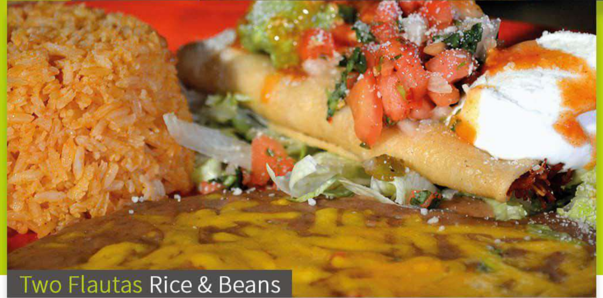
Two Flautas Rice & Beans