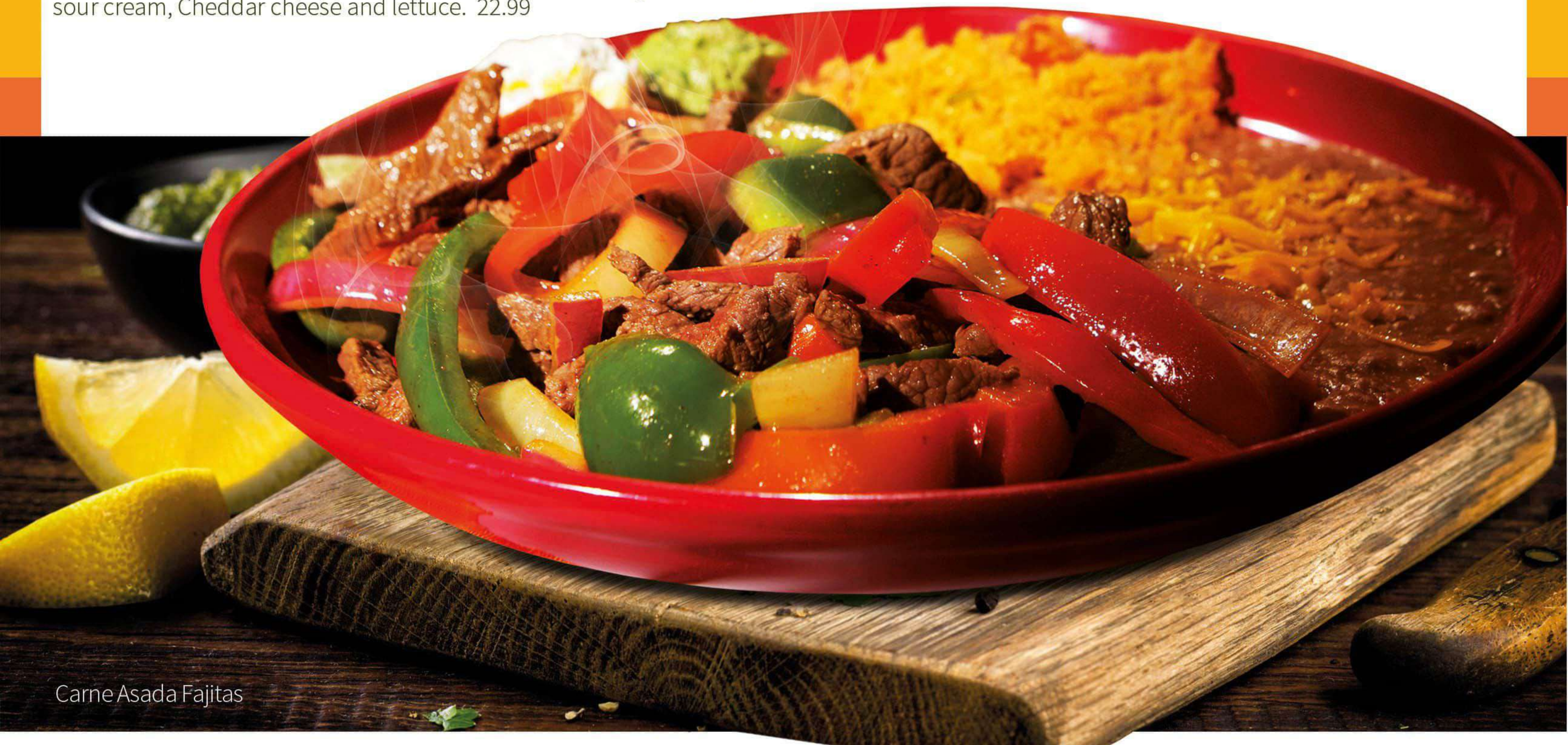
Carne Asada Fajitas

Skirt Steak sautéed with bell peppers and onions. Served with guacamole, sour cream, Cheddar cheese and lettuce. 26.99