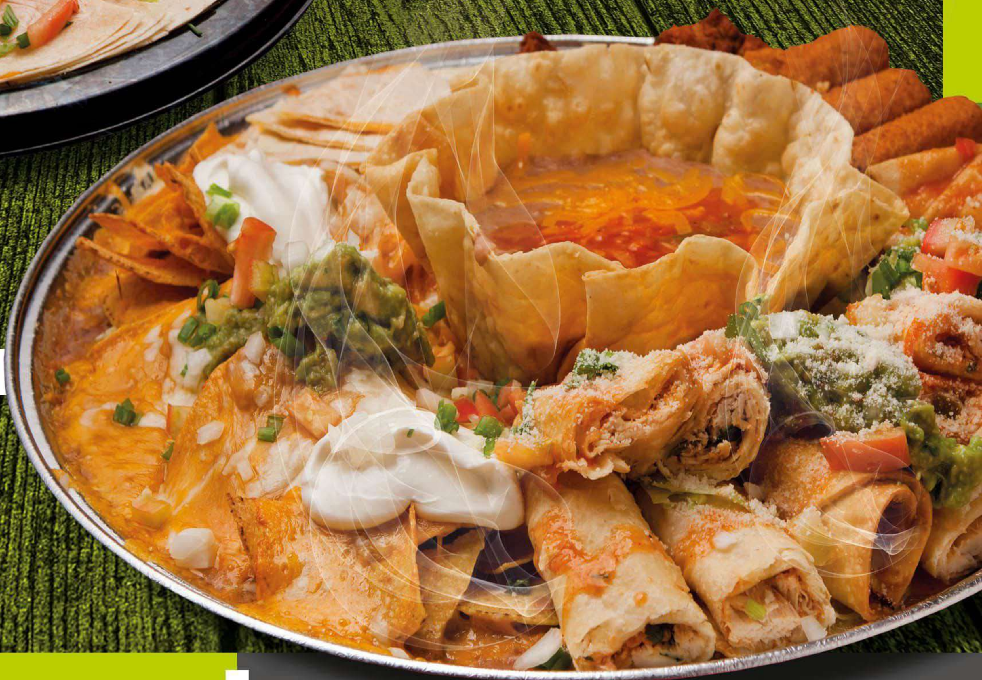
• Grande Platter •

First basket of Chips is complimentary $1 Extra Chips