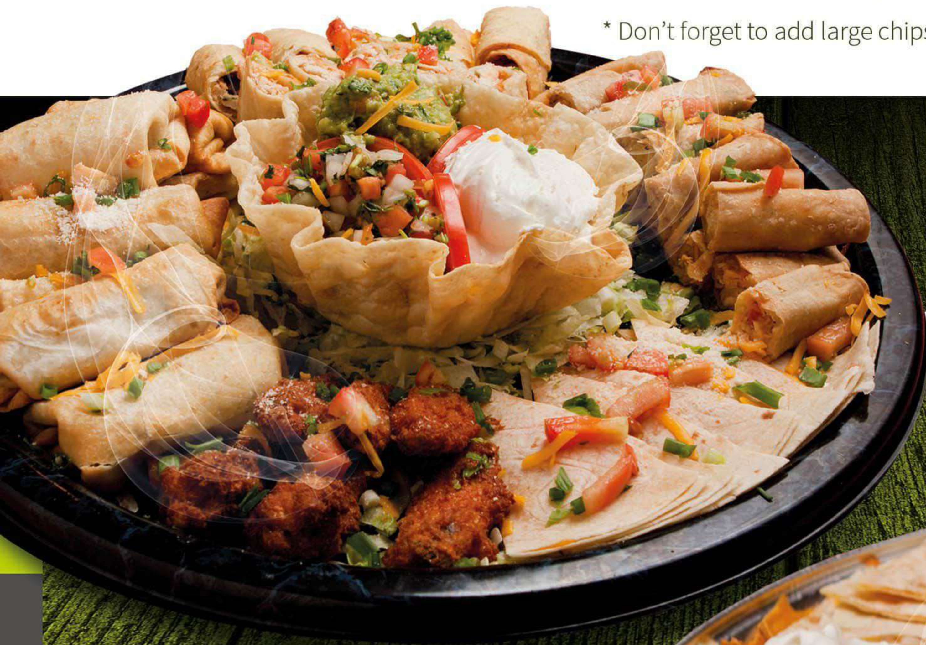
• Pachanga Platter •

* Don't forget to add large chips & salsa.