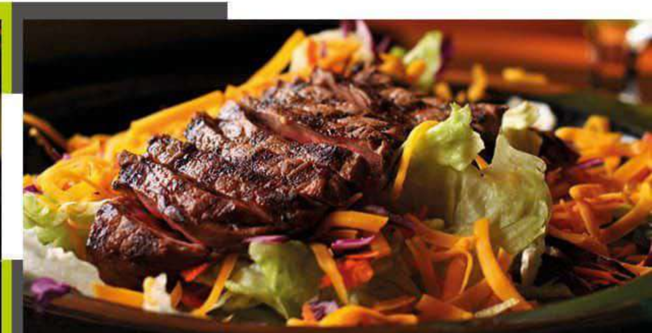
Angus Steak Salad