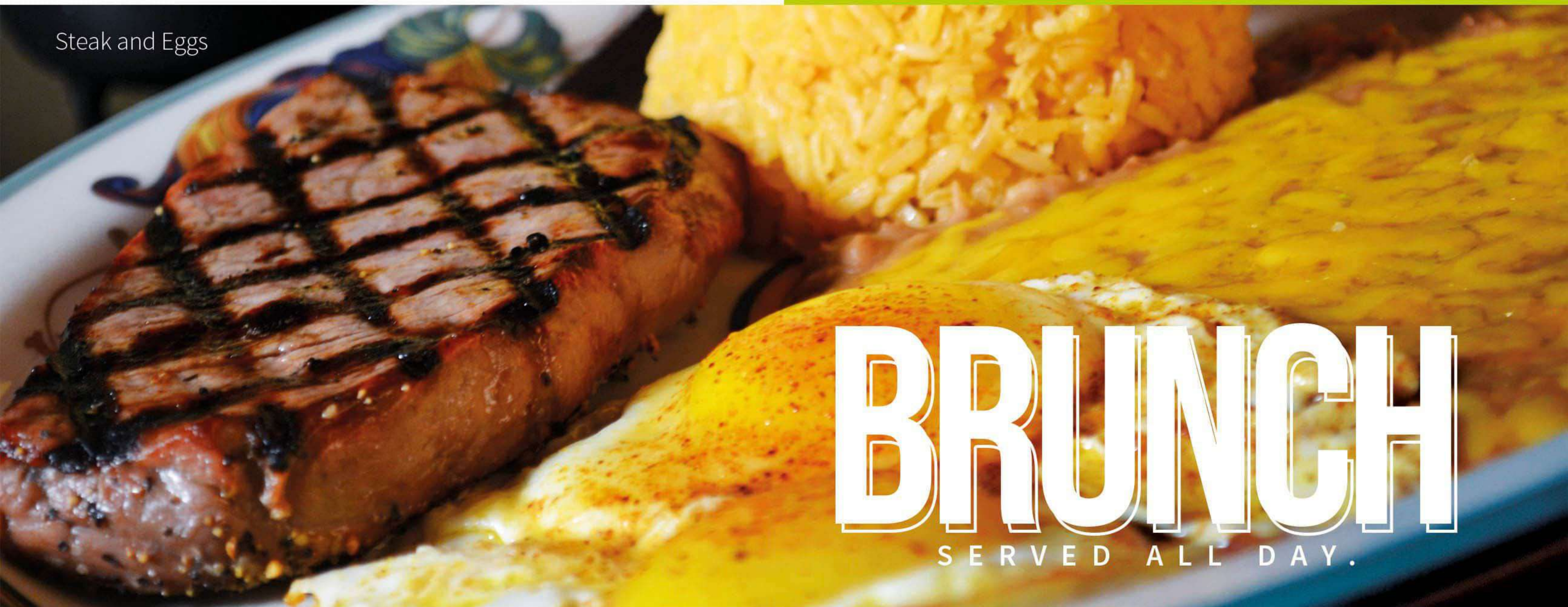
Steak and Eggs

Pollo Burger 15.99 Grilled chicken breast served with lettuce and tomato.