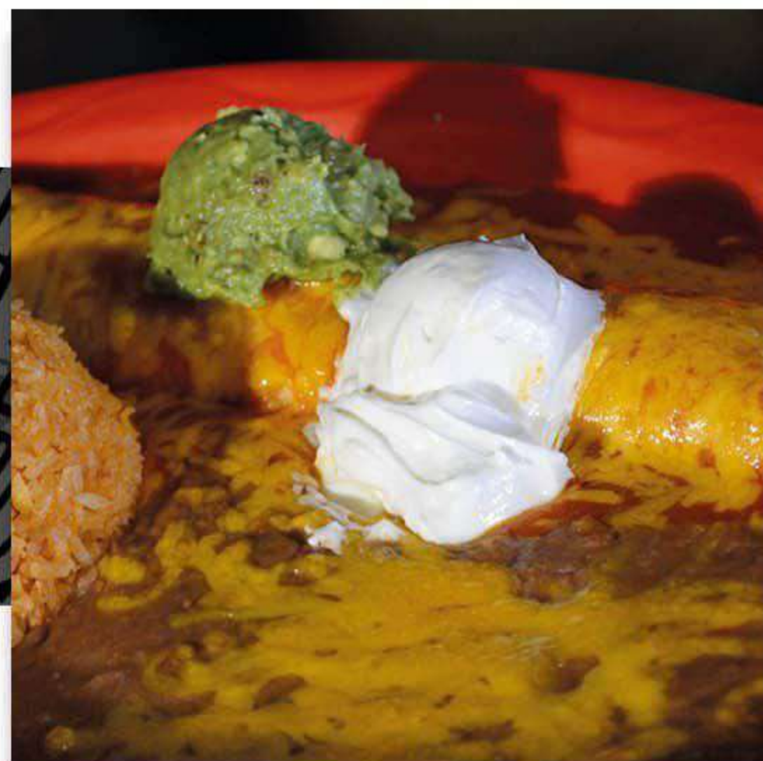
Deluxe Enchilada Granda